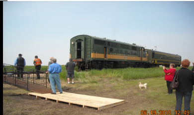
First Tourism Train comes to town June 19/10