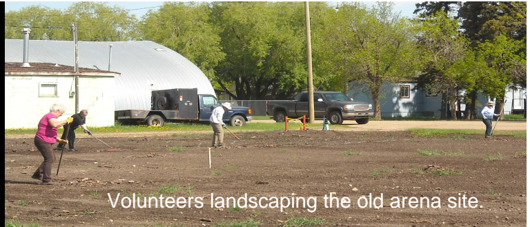
Volunteers landscaping the old arena site.

June 2013 Volume 17 Issue 6 www.villageofalliance.ca