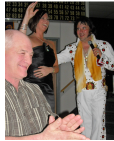
Elvis was here!!